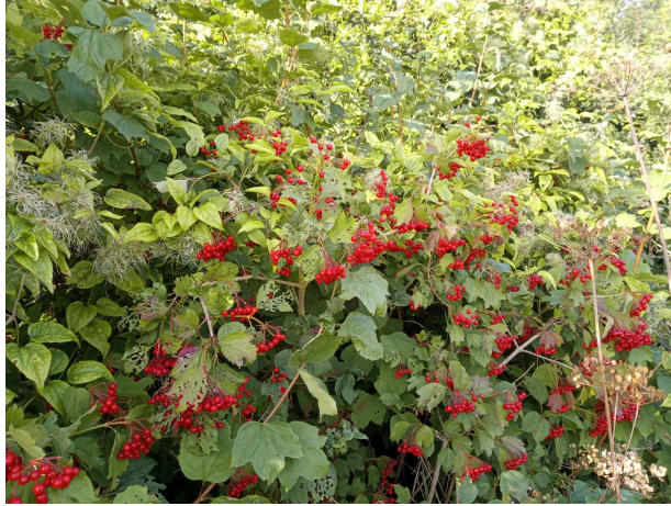
These brilliantly bright and vibrant berries are so startling that they cannot be ignored!