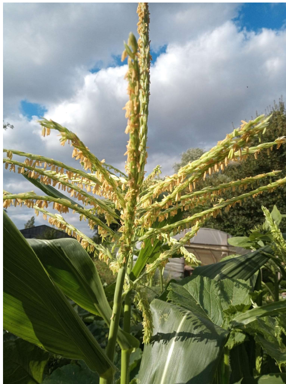
Anyone know what this is? And no, it's not a young Christmas tree!