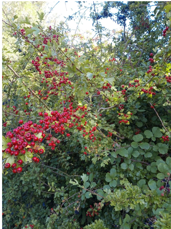
It's impossible to miss these bright red Hawthorne berries! Try and remember the names of the berries as we will be running a quiz to identify the berries and fruits!