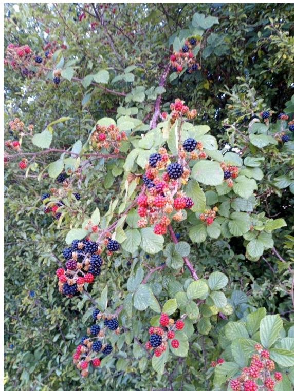
Wow! Sallet's Farm hedges are really stocked full of fruits this year! Don't the blackberries look delicious!