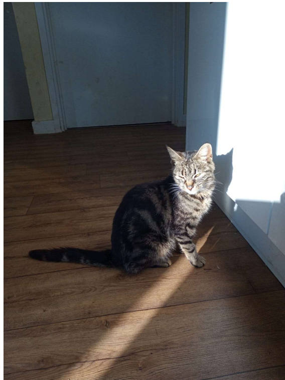
Thankfully Tiggee cat is improving from her strange illness. Here she is in the kitchen soaking up the Autumn rays!