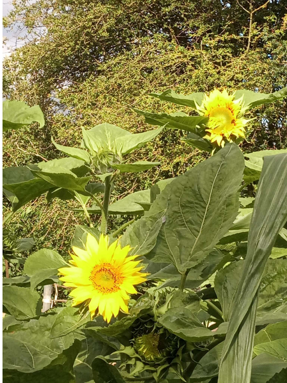
Look at these stunning sunflowers in rainbows garden. They're bright enough to make everyone happy!