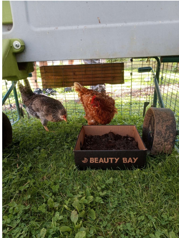
Here is Humbug and friend checking over their new dust bath in their run. It seemed appropriate that the box said Beauty Bay!